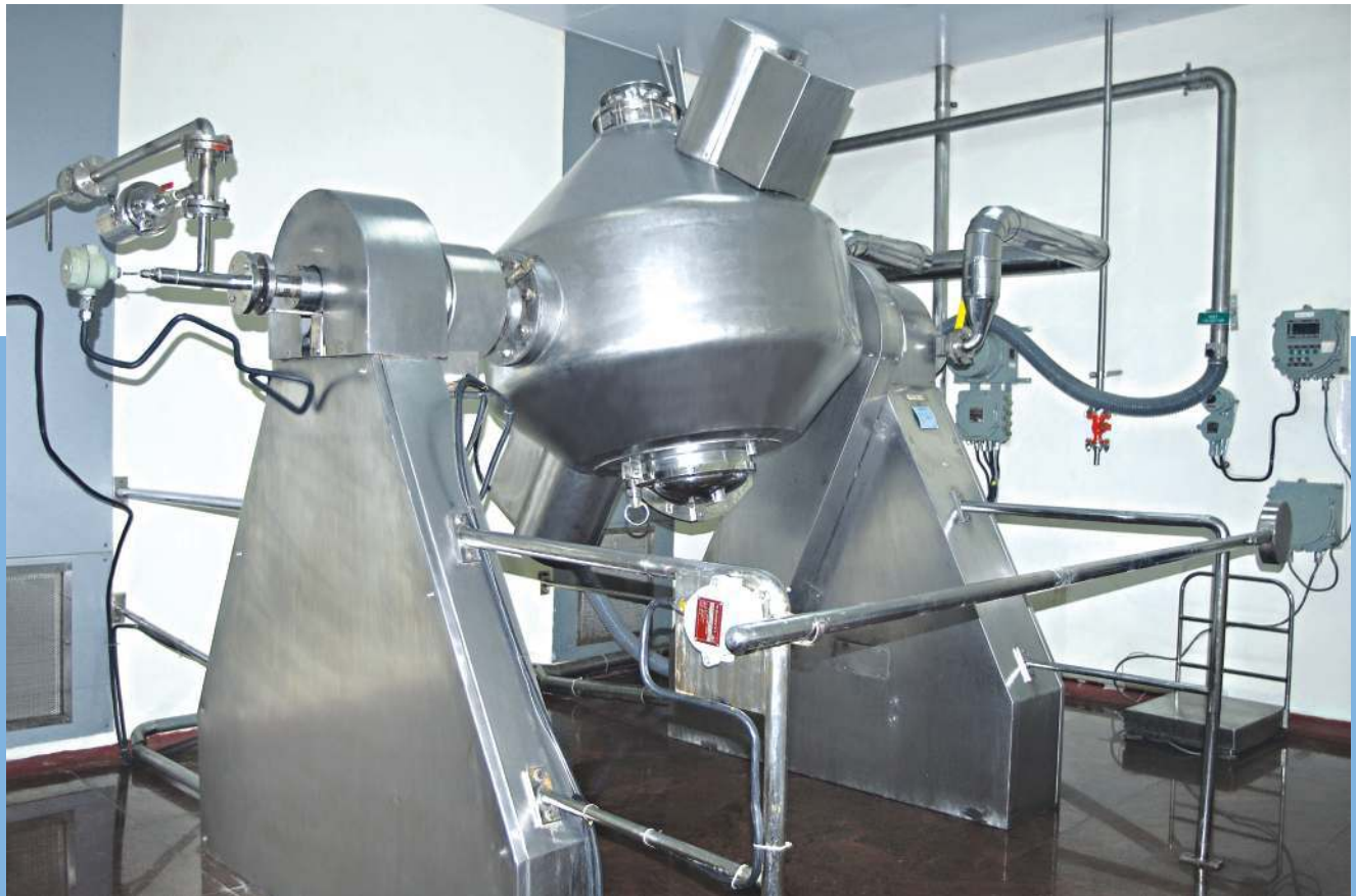
400 Ltrs. RCVD with 2 nos. choppers.

The Roto Cone Dryer with improved technology integrates drying operation under vacuum. The Roto Cone Dryer facilitates enhanced drying efficiency low temperature operation and economy of process by total solvent recovery. It helps cGMP - based working by achieving optimum dust control, while offering the advantage of efficient charging and discharging of materials. The dryer is also available with an optional thermal medium system.